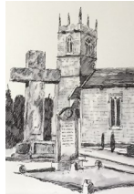
St. Winifrid Stainton

on Sunday 10th March The Fourth Sunday of Lent Mothering Sunday