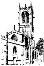
St. Mary Tickhill