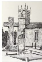
St. Wulfstan Stainton

Children are most welcome at all services