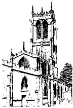
St. Mary Tickhill