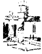
St. Winifrid's Stainton

Children are most welcome at all services